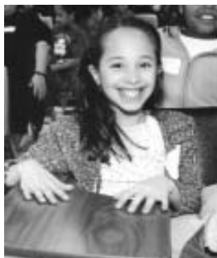
Fifth grade girls were encouraged to pursue scientific careers at the Physics Circus.