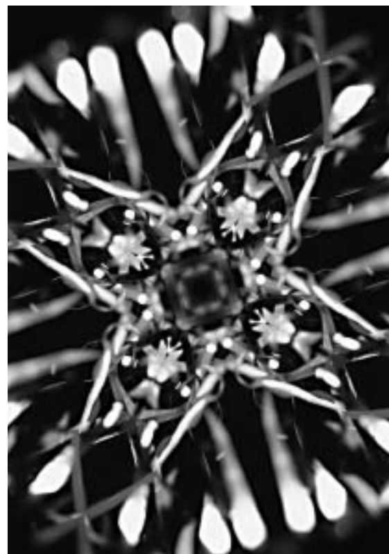
A new particle detector in Switzerland will produce 40 million proton collisions per second.