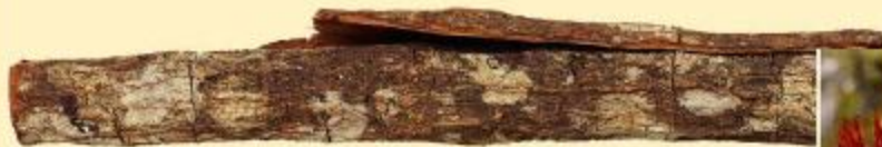
Cinchona bark, source of quinine