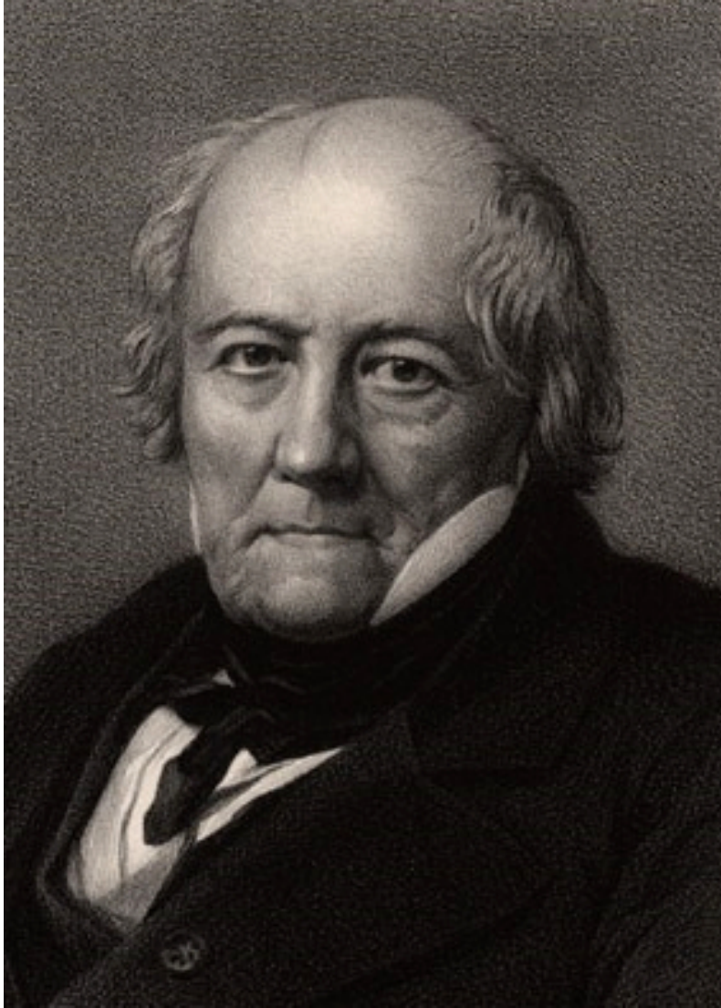
Jean-Baptiste Biot 1774-1862