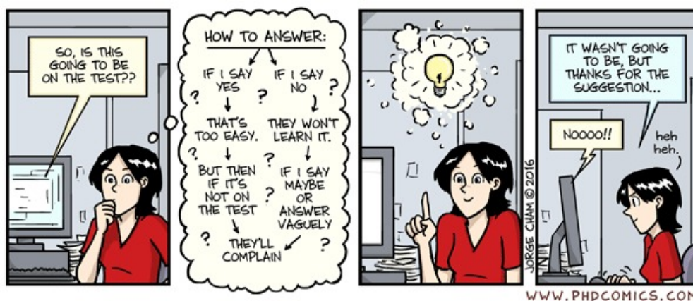
Figure 2: Before you ask your instructor, “Will this be on the test?”, think very, very, very carefully.

There will be a series of in-class exams throughout the semester: Thursday, September 22, 2016; Thursday, October 20, 2016; and Thursday, November 17, 2016 ) which will cover topics in the course incrementally. The core of the final exam will be incremental and only cover material that was introduced since the material covered on Exam 3. The final exam will be held on Friday, December 9, 2016, from 8:00 a.m. - 11:00 a.m. in FOSC 158. In addition to incremental new material, the final exam period will be used to assess individual understanding of solutions to the Grand Challenge Physics Problem (see below).